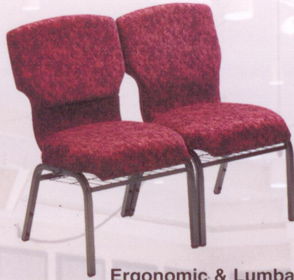
Ergonomic & Lumbar Back

The Prodigy utilizes a one piece body as its structural frame. The back and seat are flat side-to-side, to allow for sitting across the joint. All options stated for the #1800 apply. Available in single 20 1/2" and double 40 1/2" seating width. 35 1/2" H, 23" D, 22 lbs.