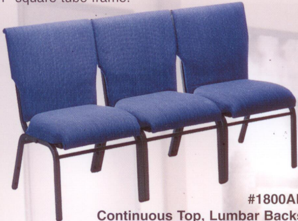
#1800AF Continuous Top, Lumbar Backs Patent #D401, 769

The Diplomat was designed to be a seating system using relaxed seating standards as its criteria. Chairs are made to order after the selection of the following options: flat or rounded tops, lumbar or ergonomic backs, single 20 1/2" or double 40 1/2" width, open or closed rear surface, accessories, fabric pattern and color and metal frame color. Ganging units are standard. 20 1/2" W, 24 1/2" D, 35 1/2" H, 22 lbs. unboxed, 3" seat foam, 2 1/4" back foam at lumbar area and 1" square tube frame.