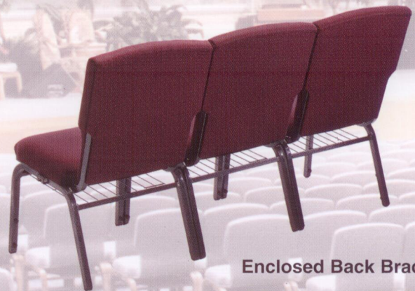
Enclosed Back Braces