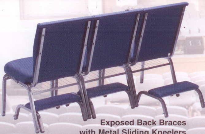
Exposed Back Braces with Metal Sliding Kneelers