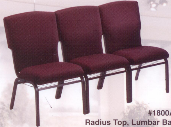
#1800AR Radius Top, Lumbar Back Patent #D502,014