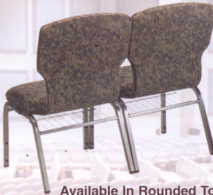
Available In Rounded Tops or Continuous Tops