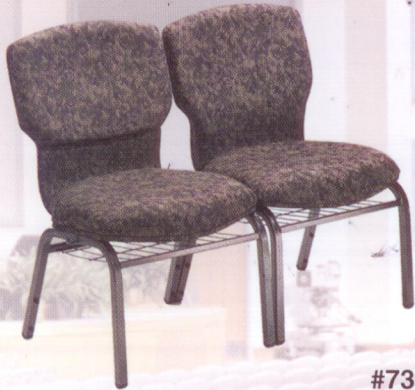
#7300 Ergonomic & Lumbar Back