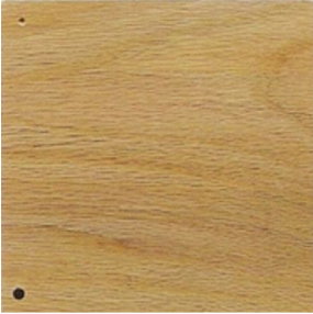
Natural Oak 113