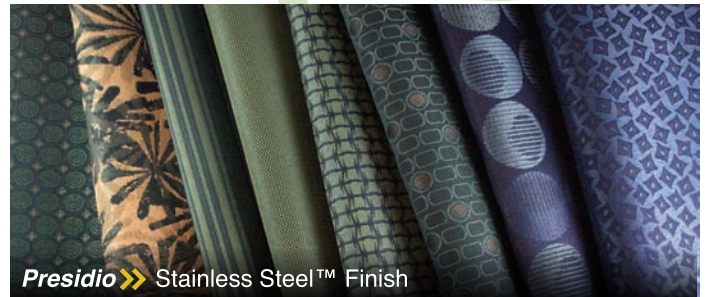
Presidio >> Stainless Steel™ Finish