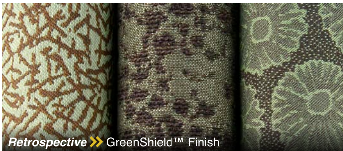
Retrospective >> GreenShield™ Finish