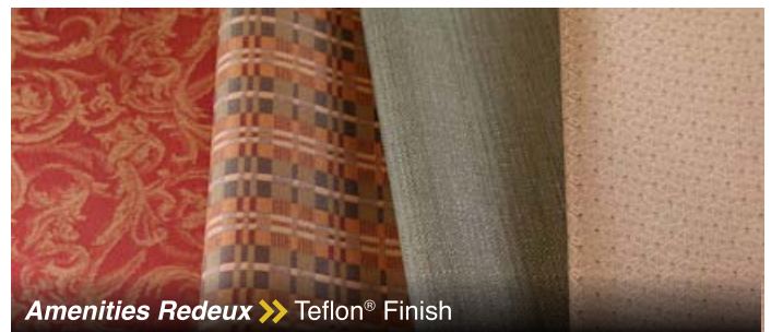
Amenities Redoux >> Teflon® Finish